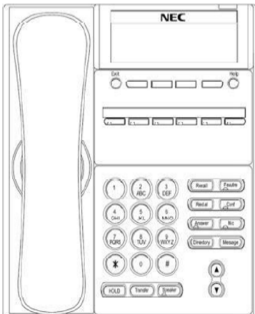
Digital Terminal Layout