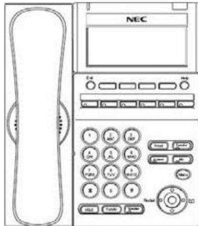
IP Terminal Layout