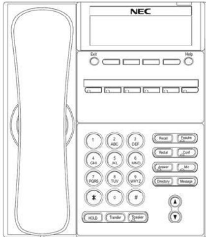
Digital Terminal layout