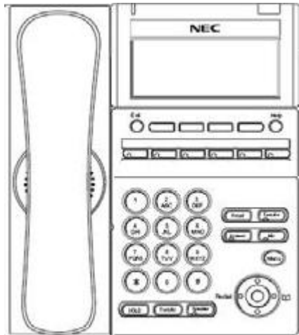
IP Terminal Layout